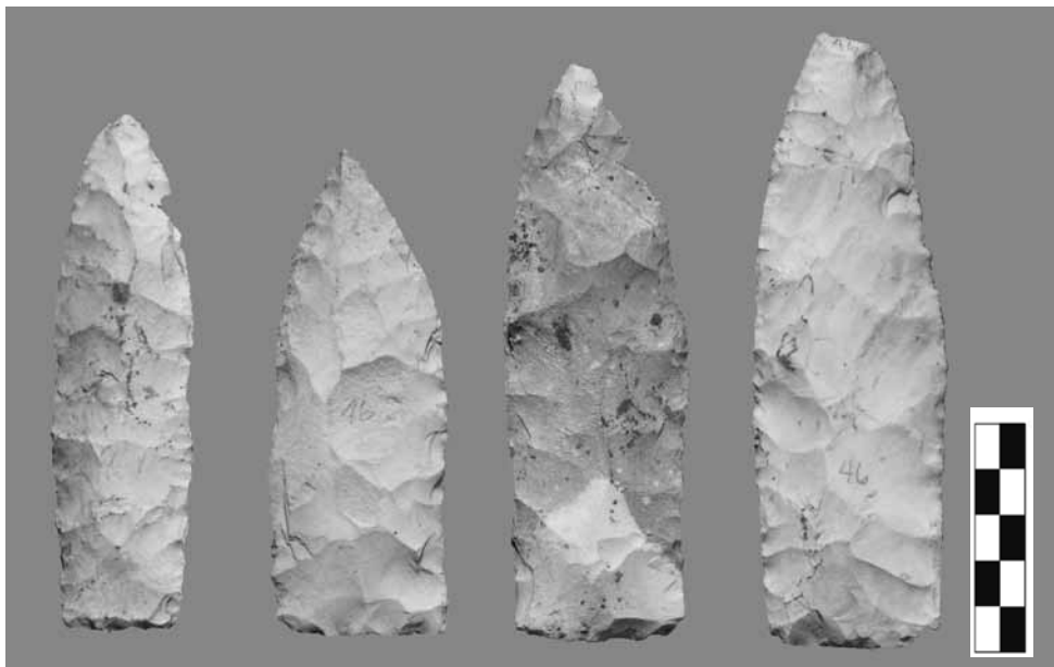
Etley preforms from the Schoettler Road site (23SL178/1105), artifacts and photo courtesy of Richard Martens.